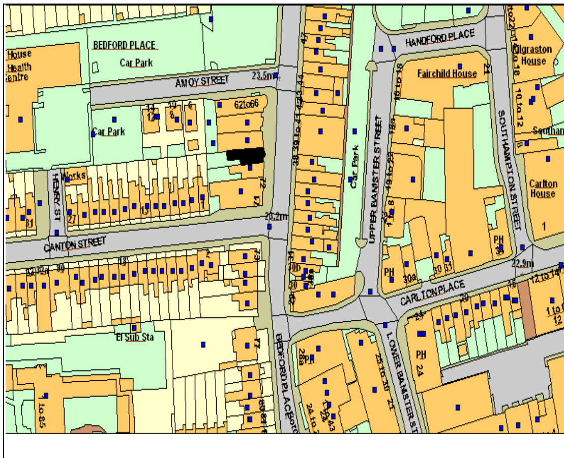
This map is reproduced from Ordnance Survey material with the permission of Ordnance Survey on behalf of the Controller of Her Majesty's Stationery Office © Crown copyright. Unauthorised reproduction infringes Crown copyright and may lead to prosecution or civil proceedings. Southampton City Council Licence No. 100019679 2007.

Application Valid Date: 10th December 2010